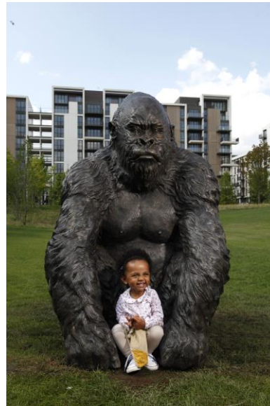
East Village, 2014